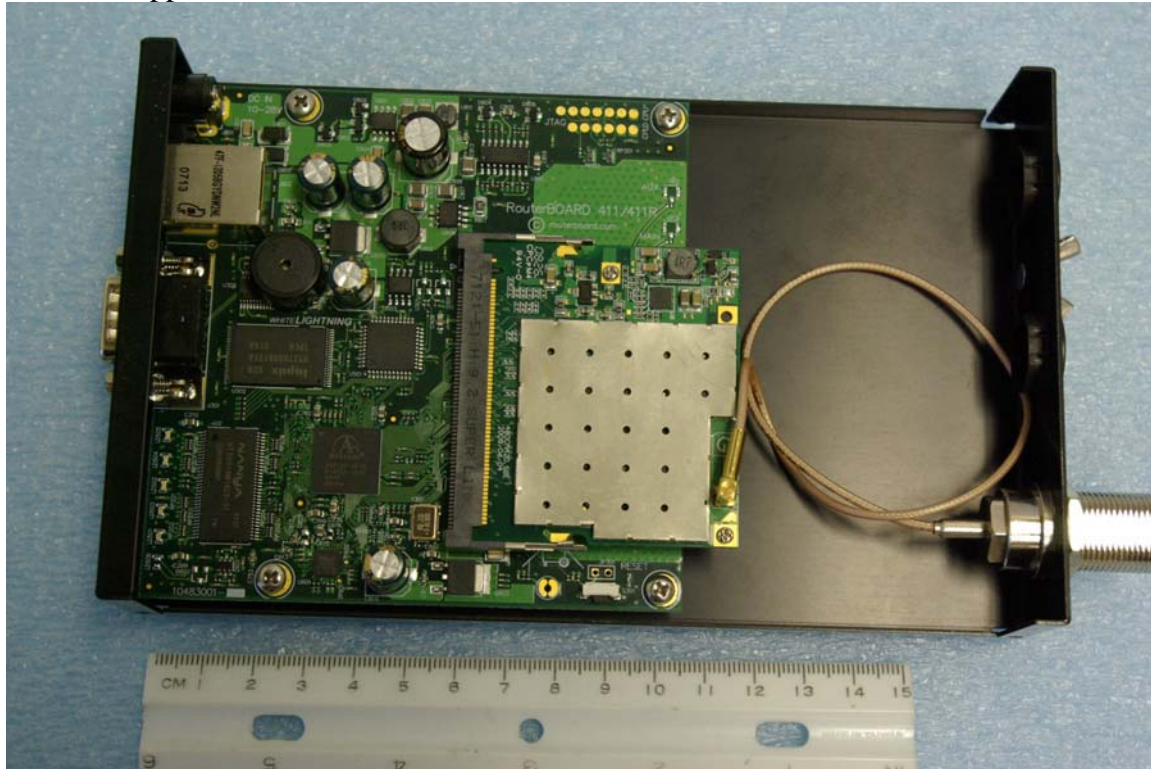
PCB with shield of EUT

Internal photographs of equipment under test EUT on Support board